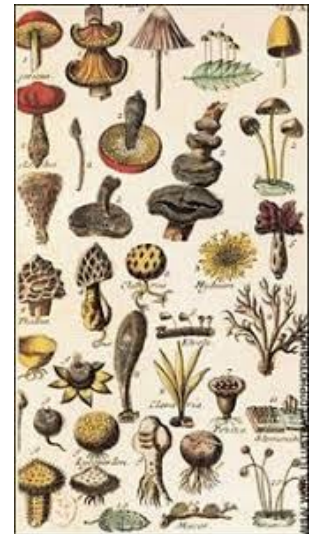
Linnaeus's System of Classification

To describe how living things are classified into broad groups according to common observable characteristics and based on similarities and differences, including micro-organisms,